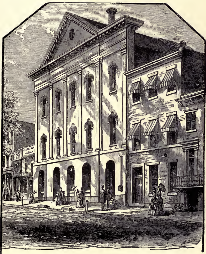
FORD'S THEATRE, WHERE PRESIDENT LINCOLN WAS ASSASSINATED.